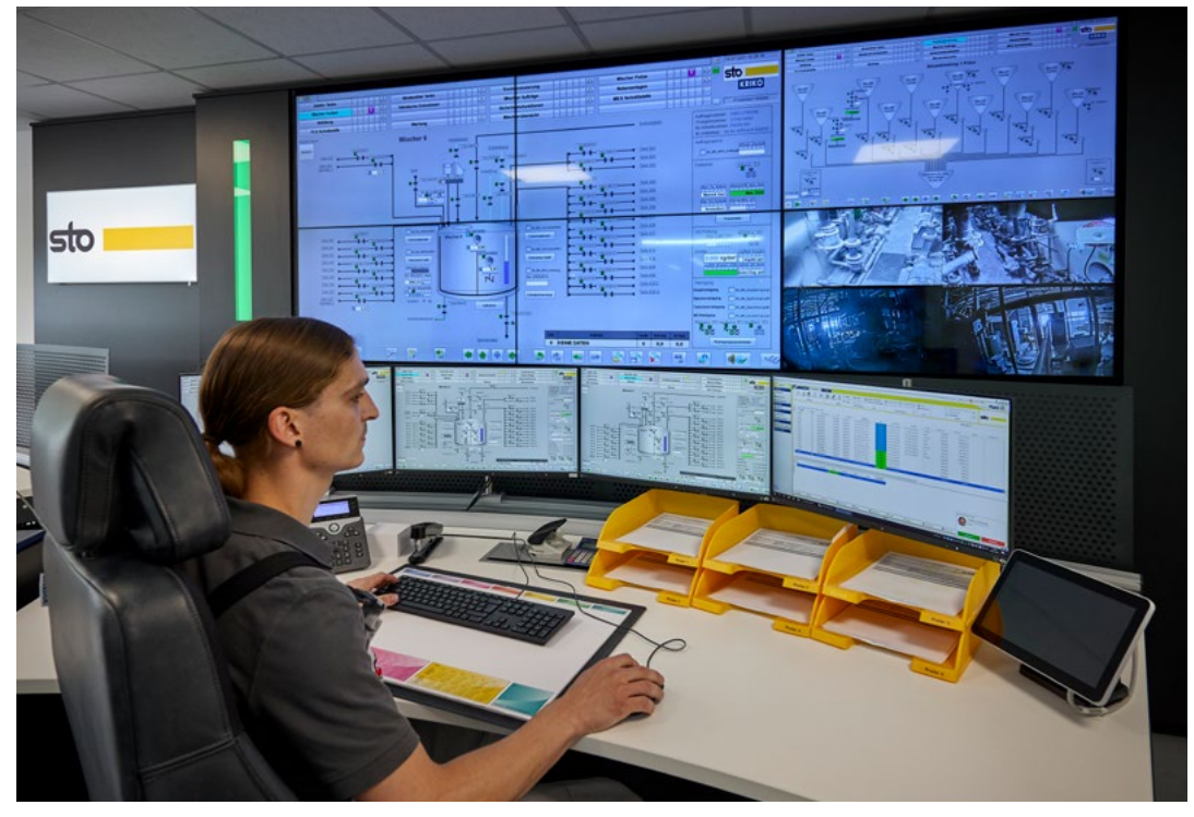
The control center at Sto.

Sto can therefore proudly claim to operate one of the most innovative MES solutions currently available on the market. The Stühlingen-based company is particularly enthusiastic about how flexibly ProLeiT responds to customer needs and that comprehensive support is provided beyond