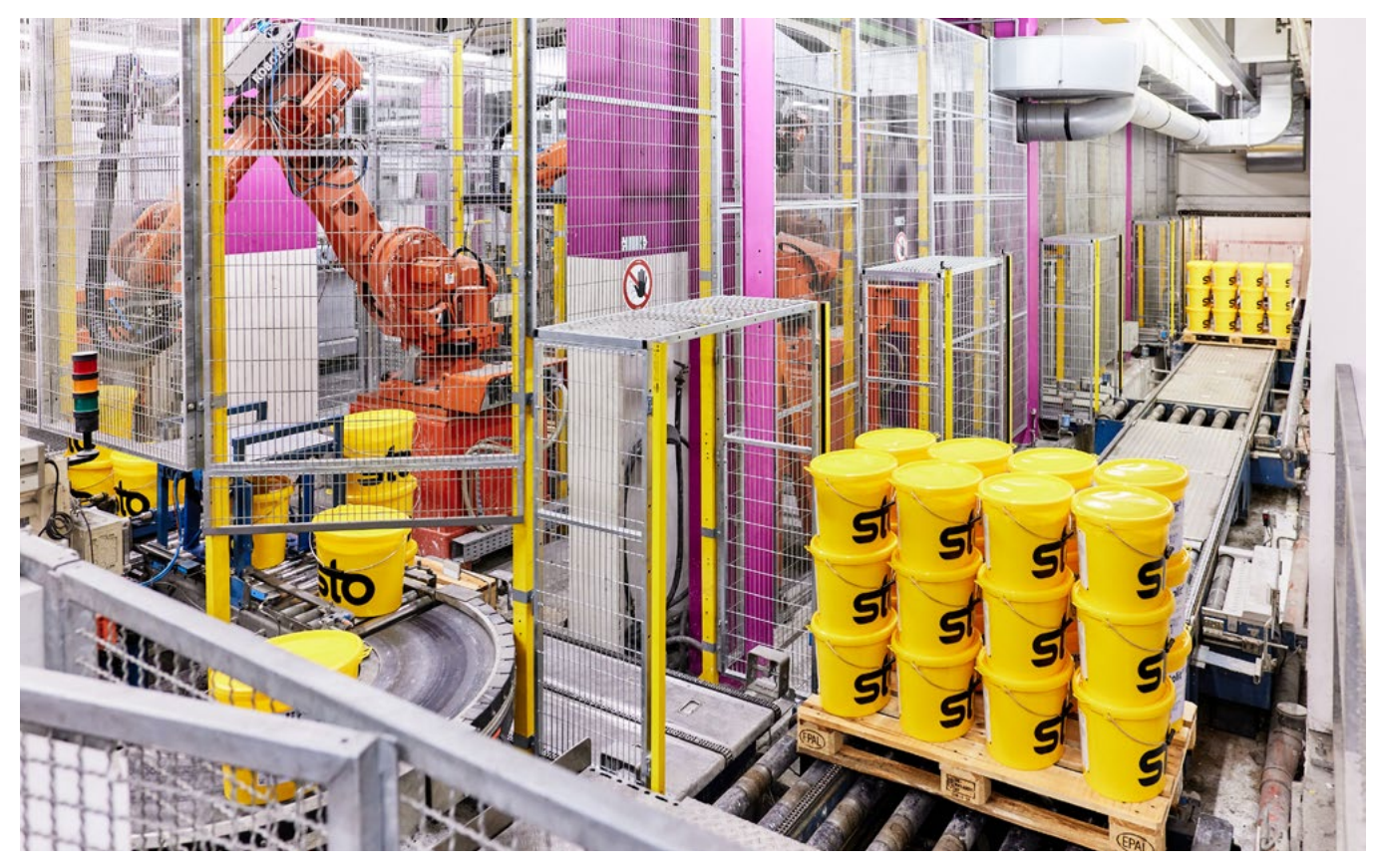
Palletizing Sto pails filled with paints and finishes, as manufactured at the various locations, including at the HQ in Stühlingen.

The plan was therefore to gradually roll out a holistic solution in the individual manufacturing plants. Any special features of the respective locations needed to be considered in a concise and consistent manner, thereby enabling their integration into the overall solution. This means Sto is not only one of the largest ongoing projects but also one in which the highest level of innovation is required. Since individual solutions have to be developed flexibly and in cooperation with each other to meet the precisely defined targets.