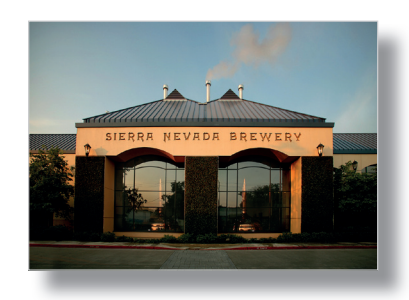
The main brewhouse in Chico, CA, that reached its capacity limits far sooner than expected